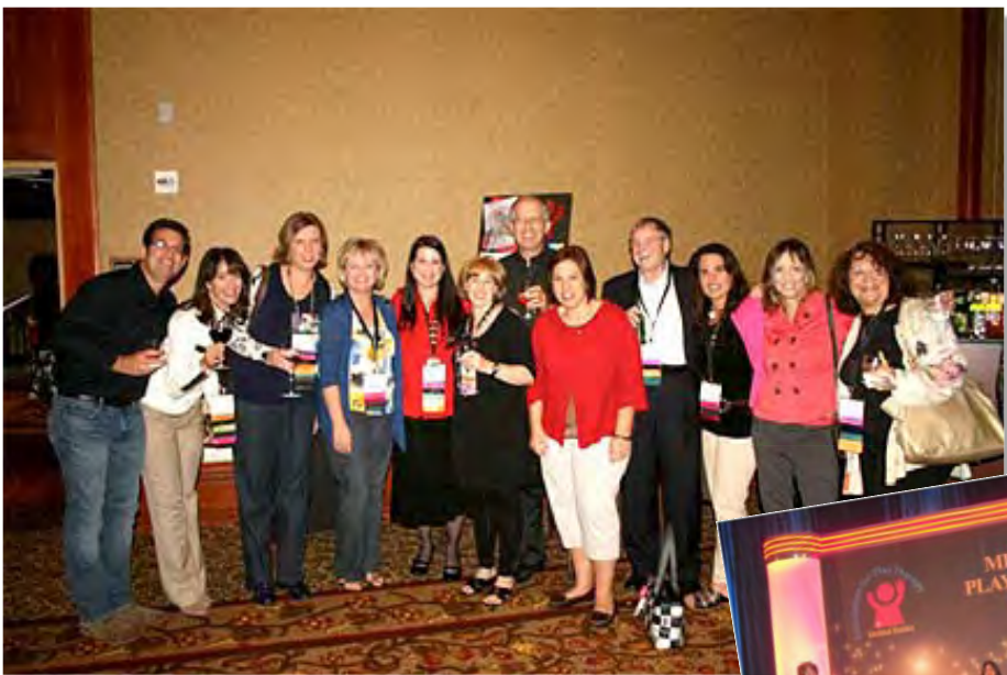
Toast to International Colleagues in Play Therapy Facebook Page

The APT conference in Sacramento, California was a huge success. It was wonderful seeing so many Texans represented in what I can only call a huge circle of care. Care for children, care for learning best practices, and care and support for your fellow colleagues.